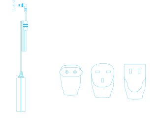
DC power adapter 12 V Power plugs for Europe, UK & US